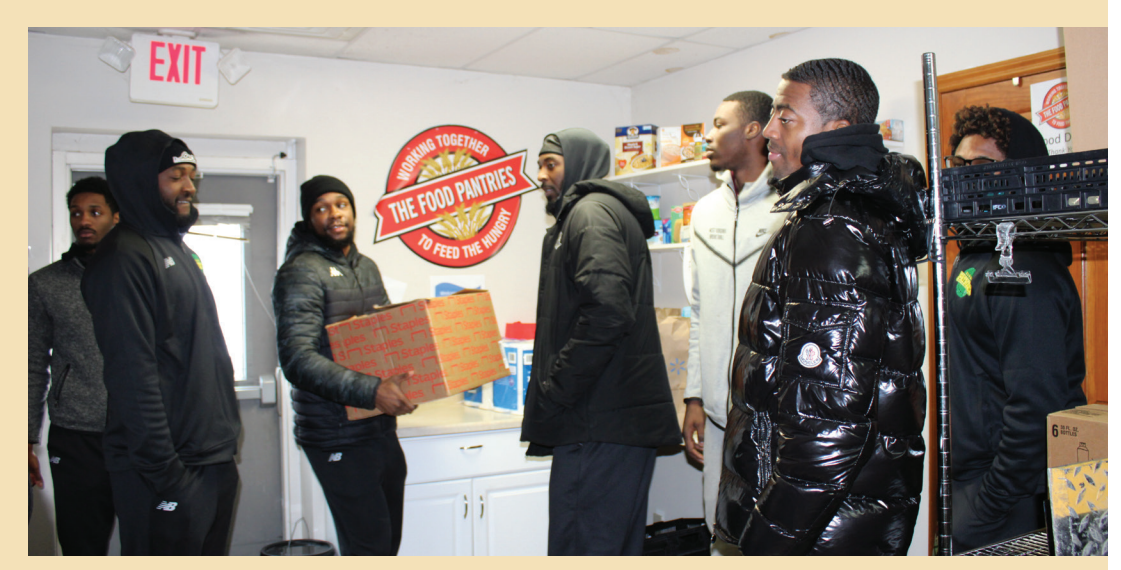
Members of the Albany Patroons lending a helping hand with Hunger Heroes donations

Total $5,953 Total 7,178 lbs of food 8th year for Hunger Heroes